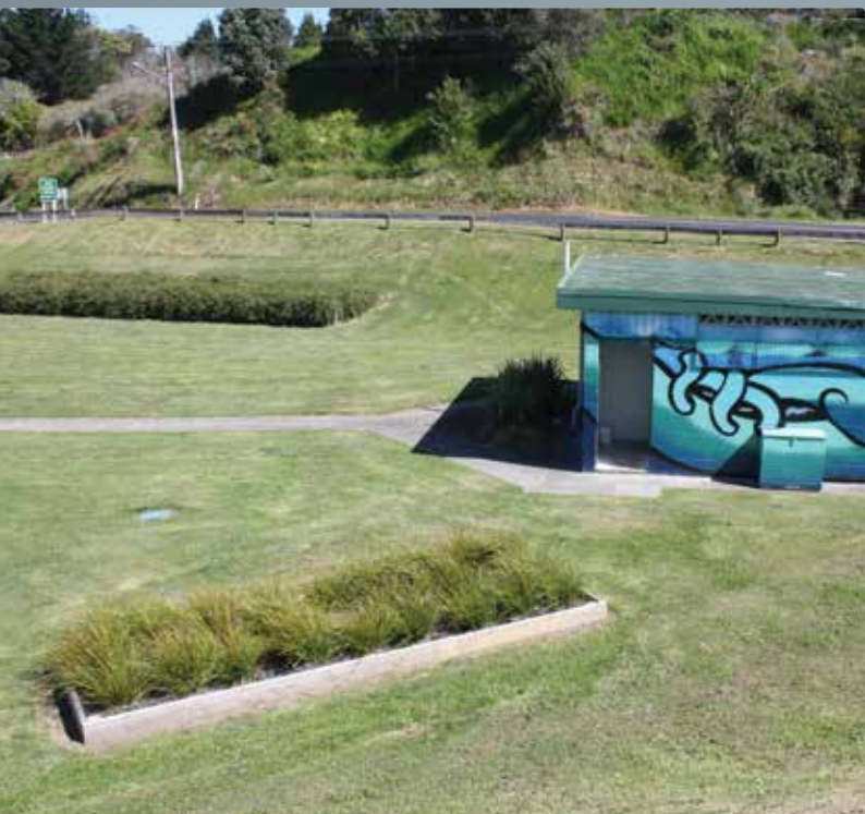
Public toilets at Waihou River reserve installed in an application in close proximity to a water way.