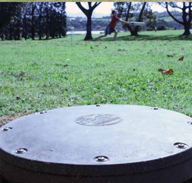
Public toilets at Huharua Harbour Park on the Plummers Point Peninsula.