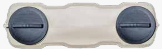
1,000L top view

Extra 25mm outlets for orifice overflow points or garden taps are simple to install with our easy plumb fittings (sold separately)